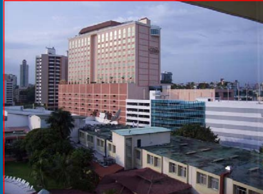
ETC CATES, OVERLOOKING PANAMA CITY