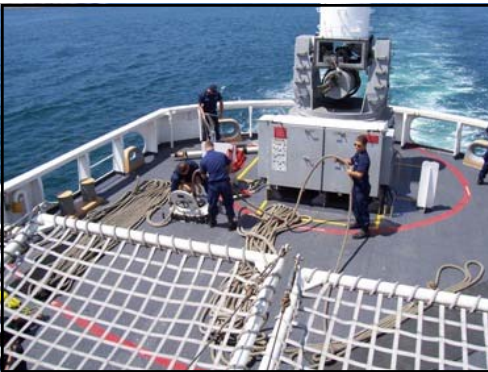
Securing mooring lines.