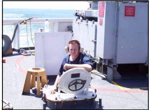
FNMK Herrod AFT steering phone talker.