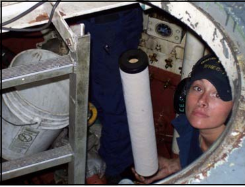
MK3 Kavanaugh in DOPR (Diesel Oil Pump Room) replacing a service filter.