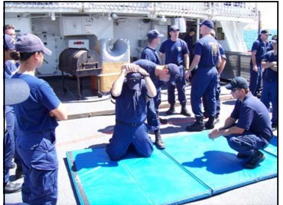
BOUTWELL crew performs law enforcement frisk training.