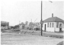
See that TR pacing along the Horn track? Pier 1 South Boston is already half demolished. What a fire those tinder timbers would have made. That was a good warm lonely shack, though.