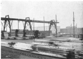
Out among the tall timber at Wiggin Lumber.