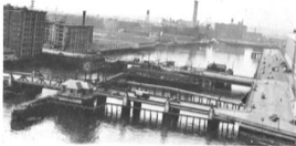
Congress and Summer Street bridges under guard.