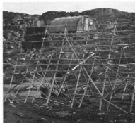
Meat drying (or Eskimo refer)