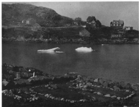
The village of Kulusuk and part of its cemetery