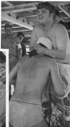
Unidentified Bluenose kissing the babys belly