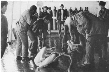
Two bluenoses suffering in pleasure before becoming Polar bears