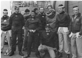
AVDET 42 in the uniform of the day

Arctic-crossing ceremonies are completely voluntary. Men who have not crossed the Arctic Circle have their noses painted blue. They are brought before Borealis Rex, the God of the North. "Polar Bears," men who have previously crossed the Circle, act as prosecutors and carry out appropriate punishment. All "Blue-noses" are guilty until proven innocent. They are char-