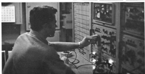
RM1 LAPRAIRIE tuning receiver