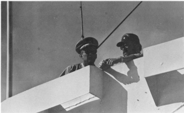
Engineering officer conferring with the Captain.