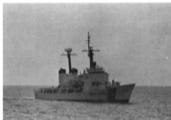
At Song Ong Doc we were relieved by the CGC Rush.