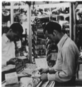
Shopping - fascinating experience in a foreign port