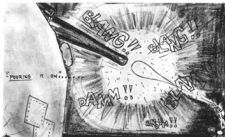
Caught in the spotlight of another ship and illuminated by star shells the infiltrator is identified.