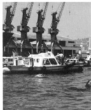
The harbor in Valpo, in the area of the boat landing.