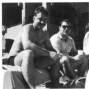
TT1 and EMC Riddle poolside.