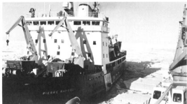
CCGS PIERRE RADISSON — 324 feet long, 62 feet wide, 8,300 metric tons and a crew of 55.