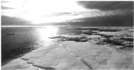
Burt Markham, Arctic Submarine Lab