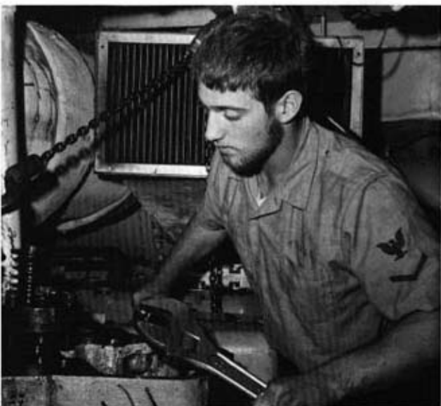
Nothing like an adjustable hammer.