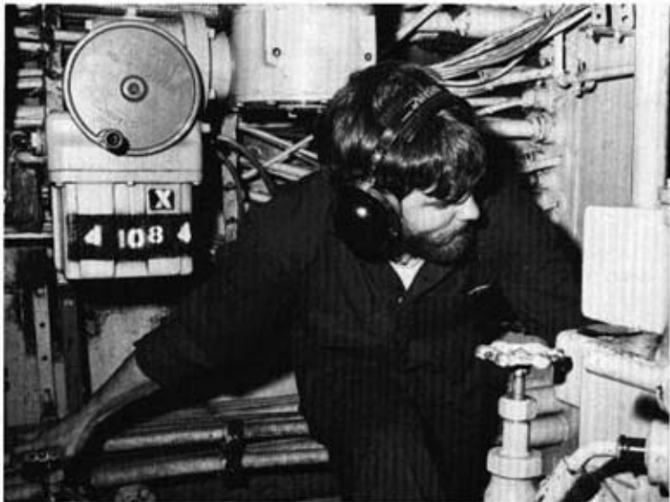
Maybe this is the valve?