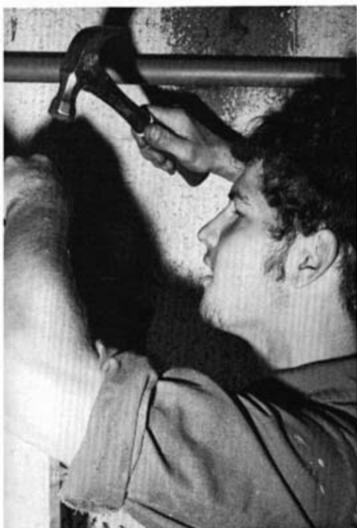
I already tried welding it.