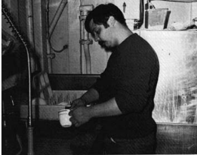
The start of another day.