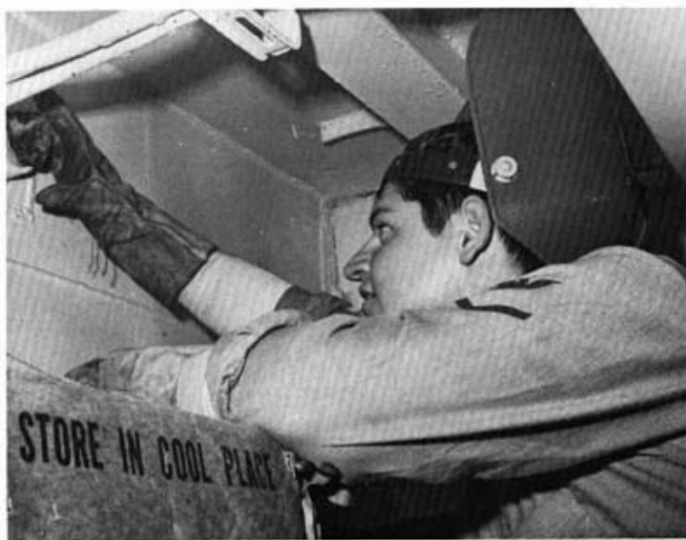
Take these stuffing tubes and stuff um.