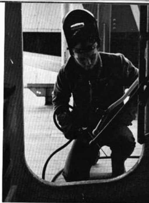
This will be the best finger masher around.