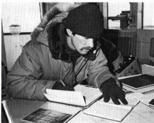
... and 5 forked tail bustards