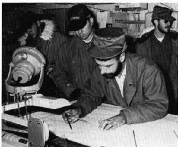
6 miles south of Billings, Montana