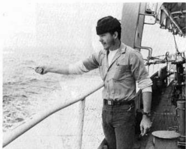
Chance of rain with chance of darkness tonight