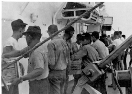
FOOD FOR THE BODY