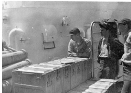
FOOD FOR THE GUN