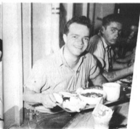
Dinner on Thanksgiving Day.

1710 fueled from the tanker USS MEREDOSIA (IX-193). 1505 - 1552 embarked passenger personnel. 1732 departed Eniwetok Atoll, Marshall Islands with 83 passengers of the Army and Navy enroute to San Francisco, California.