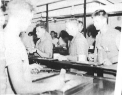
"Fill 'em up."