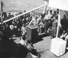
A passenger chaplain conducts service.