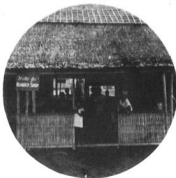
"Hello Joe" barber shop at Batangas.