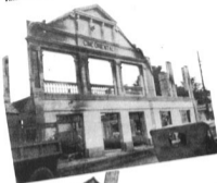
This was once the local movie house at Batangas.

29 April - 1 May, 1945 engaged in disembarking passenger personnel, fueling ship, taking on stores, water and outbound passengers.