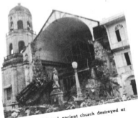
A beautiful and ancient church destroyed at Batangas.