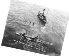
Natives diving for coins at Miaa Weendi, Schouten Islands, Dutch New Guinea.