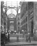
Galleria Umberto I