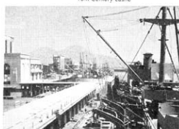
Vesuvius on the starboard quarter