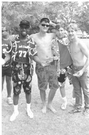
"It's Hawaii, everyone wears shorts like this."