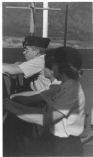
Are we there yet?