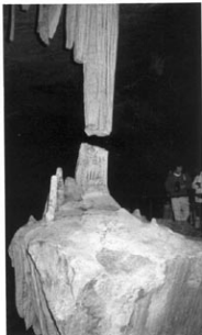
The Jenolene Caves