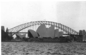
The famed Sydney Opera House framed by the Harbor Bridge