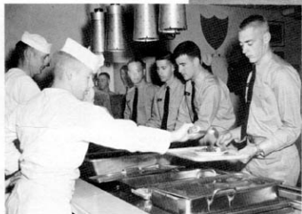
Chow down. Always a surprise as the deep delving ladle scoops up a mushroom, a celery stalk or a what have you for OC's Grant, Gall, House and Gary.