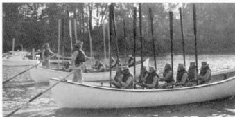
Up Oars! There's a salute for every occasion. Bravo Section Demonstrates the fine points of rowing boat protocol.