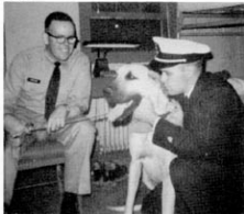
Hey mutt! What's it really like on the outside?