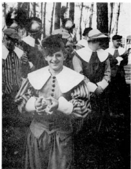
Two hand squash! OC's spent weekend before Thanksgiving masquerading as Pilgrims in Yorktown commemoration.