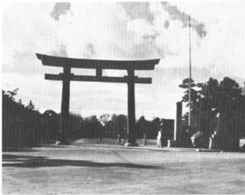
ENTRANCE TO TEMPLE AREA — NAGOYA