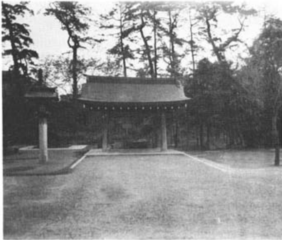
SHINTO SHRINE — TEMPLE AREA — NAGOYA