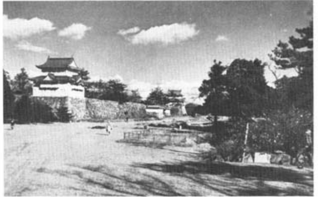
17TH CENTURY OWARI CASTLE — NAGOYA, JAPAN