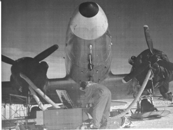
POLE-BOUND "QUE SERA SERA" BEING WARMED UP BY PRE-HEATER JUST BEFORE HISTORIC FIRST LANDING.