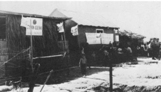
At left is the old dispensary and to its right is the new DALLAS made dispensary.