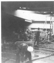
Men pick up gear after fire