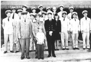
Complement has grown since start in April, 1943