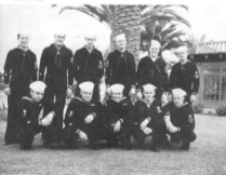
Present fire crew at Newport lines up formally for group picture. They took over the FREEDOM when SEABISCUT was put out of service.