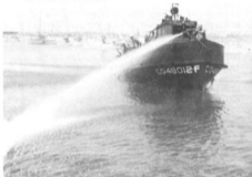
Here the BRIGHT shows off her ability to throw water, has forward monitor and four hose lines aft churning up bay.