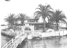
Bow on view of Newport CG station seen from deck of fireboat in slip. Station is on Collins Island once owned by James Cagney.