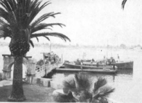
View from lawn in front of Newport CG station shown CG-57005, present fireboat, CG-60005 and picket boat CG-38696 in slips.