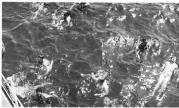
"Swim call!" There wasn't very many of the BEAR crew left aboard when swim call was held in the fresh water lake of the Panama Canal.