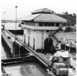
One of the Panama Canal "mules" in action pulling the BEAR through the Miraflores Lock.