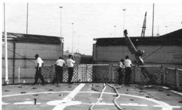
The gates close behind us as the BEAR goes through another of the locks while transiting the Panama Canal.