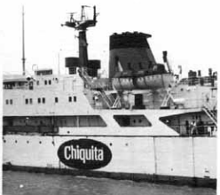
This Chiquita Banana ship was with BEAR all through the Canal.