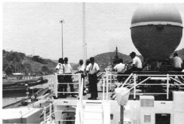
Good friends and relaxation were the order of the day for transiting the Panama Canal.