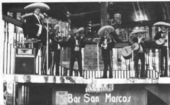
Bar San Marcos in Tijuana offered fine Mexican cuisine along with some good old American dishes like turkey sandwiches!