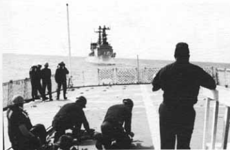
The BEAR's first attempt at towing another vessel - in this case the USS DAVID R. RAY.