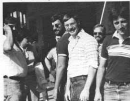
Look out Mexico, here comes the party!