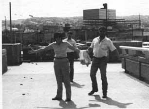
DO-RE-ME-FA . . . It's nice to be in Tijuana!!