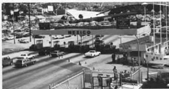
WELCOME TO MEXICO!